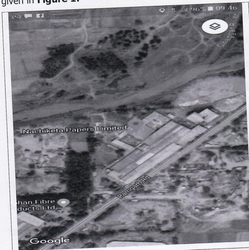
Figure 1. Location details of M/s. Nachiketa Paer Mill Mills Limited., Vill. Mubarikpur, Ramgarh Road, Dera Bassi, SAS Nagar-140 201 as per Google Map